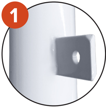
1. Fixations for net lifting frame included